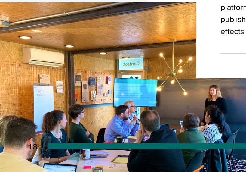
Workshop with Hearken and the Wichita Journalism Collaborative

The Collaborative includes 10 media and community partners working to collaborate, facilitate audience engagement initiatives and push the boundaries of traditional delivery platforms. Since launching, partners have published several in-depth stories covering effects of COVID-19 in Wichita.