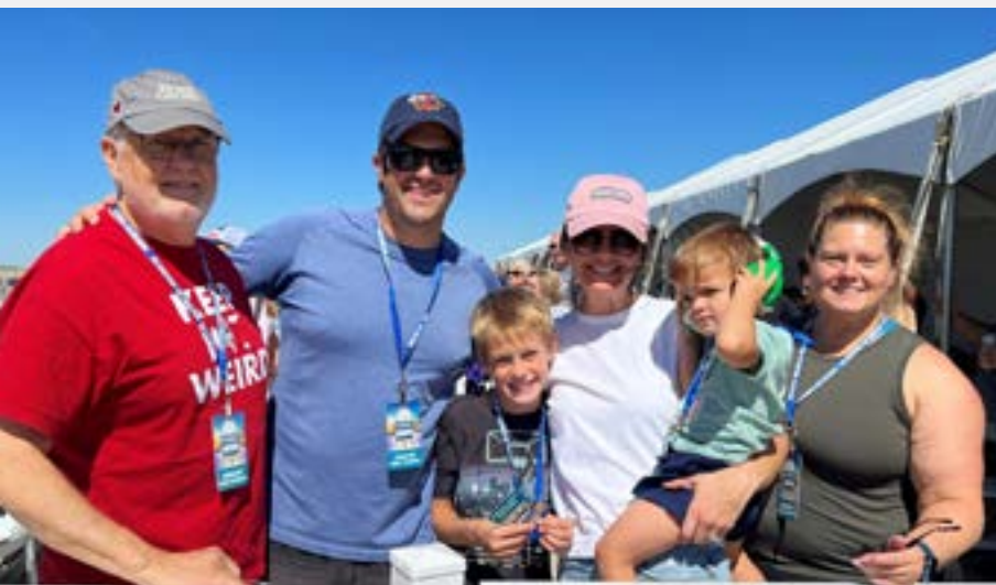
Right: WF event where fund holders attended a screening of Storm Lake