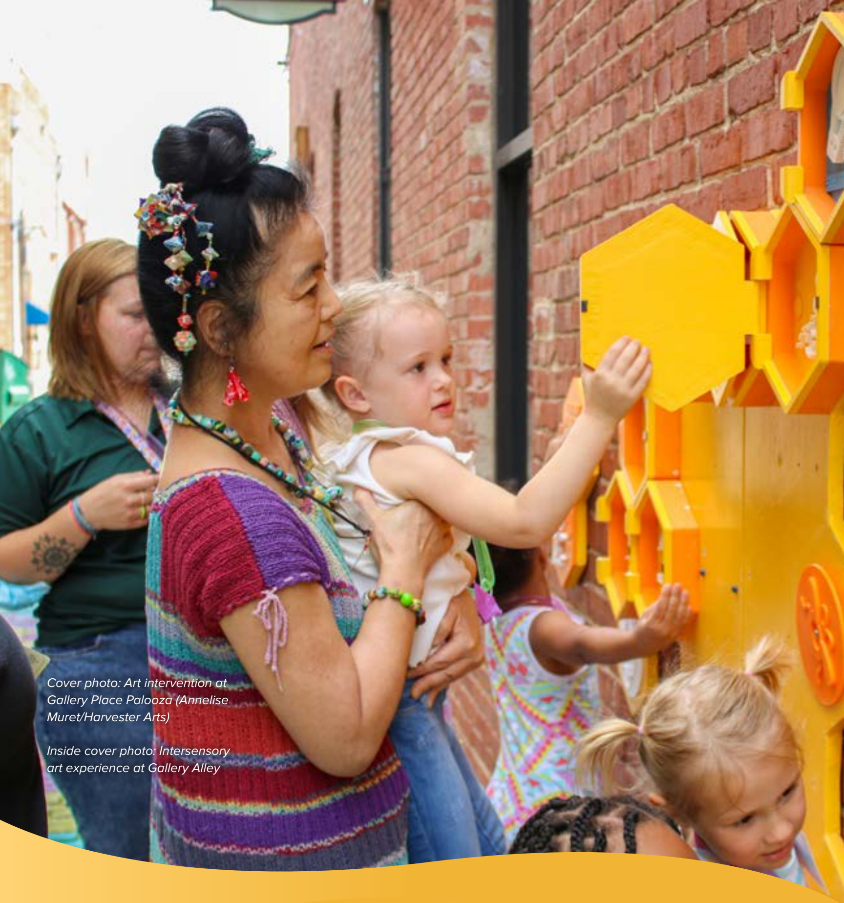
Cover photo: Art intervention at Gallery Place Palooza (Annelise Muret/Harvester Arts)